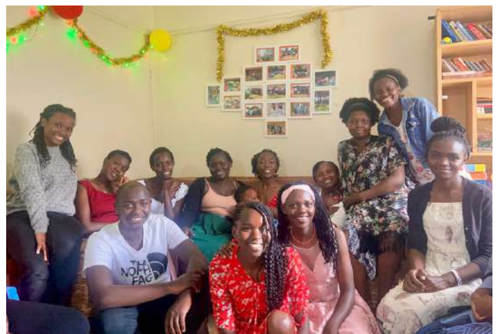
Christmas lunch with our students, volunteers and staff at the NRF residence.