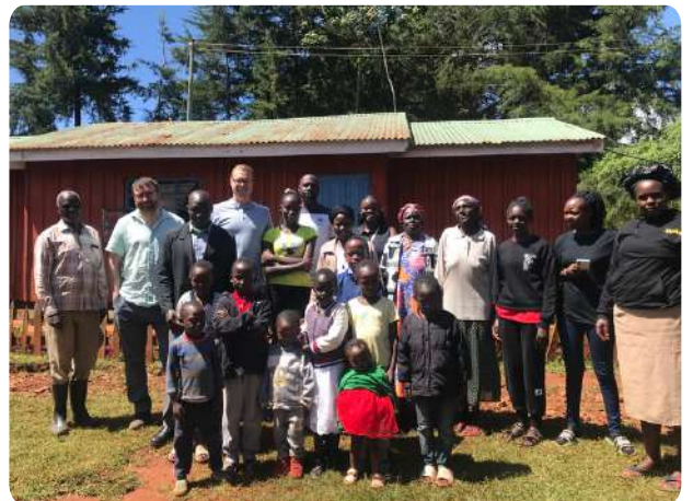
New Routes team visit to Abisag's home.