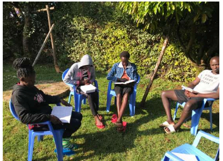
Students having a morning bible study session.