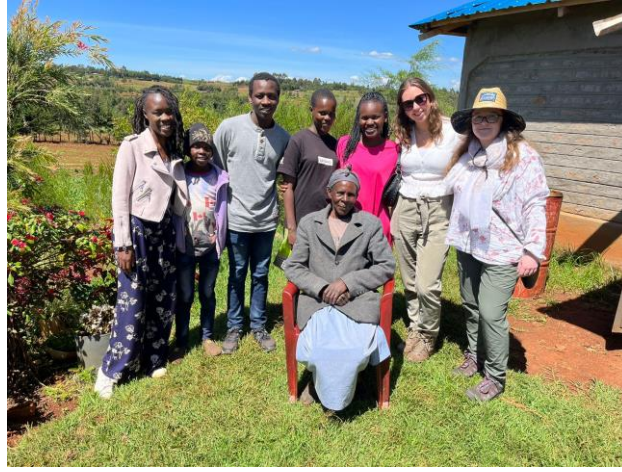
A visit to Ruth's home