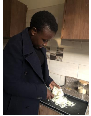
Orpah preparing lunch