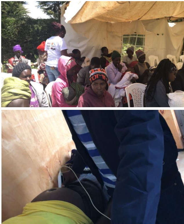
An ultrasound session during the community outreach

Representatives from New Beginnings Crisis Pregnancy Centre distributing diapers to pregnant women and young mothers.