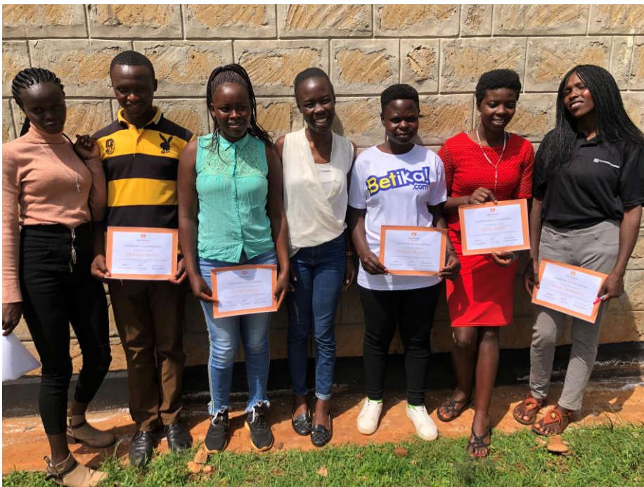
The Skills and Mentorship Programme beneficiaries with their certificates