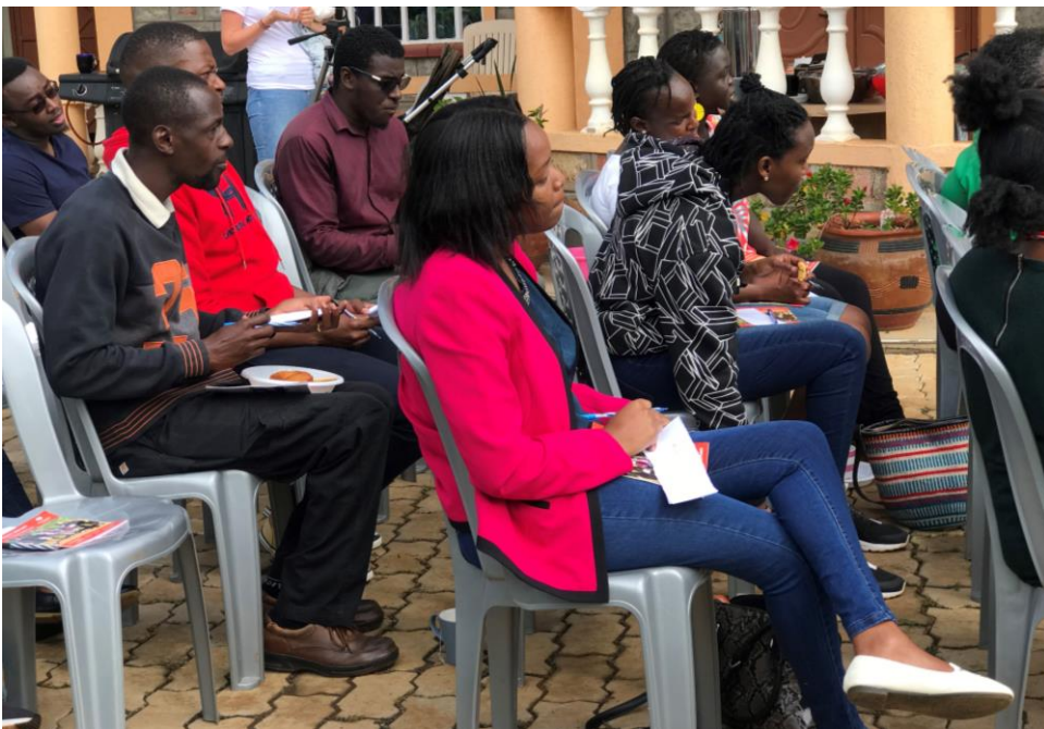
Some members of the New Routes Open Day audience