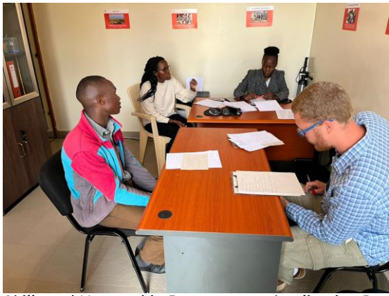
Skills and Mentorship Programme - Application Day