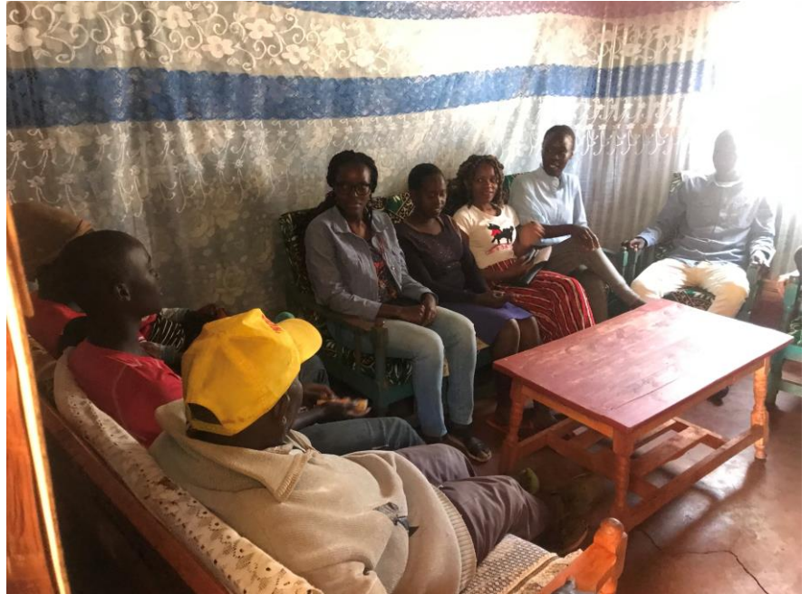
A visit to Abi's home