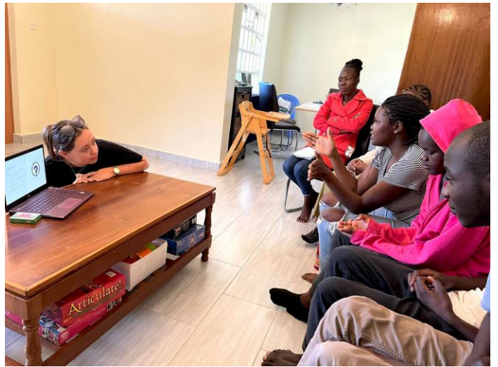
Our students learning about life in the UK